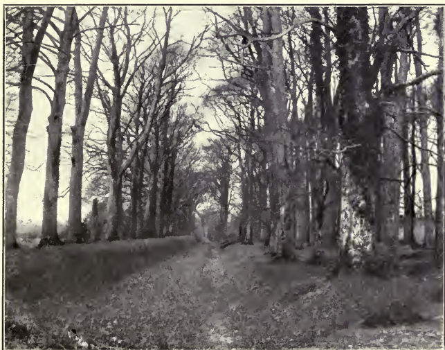
THE GROVE AT WOODBROOKE